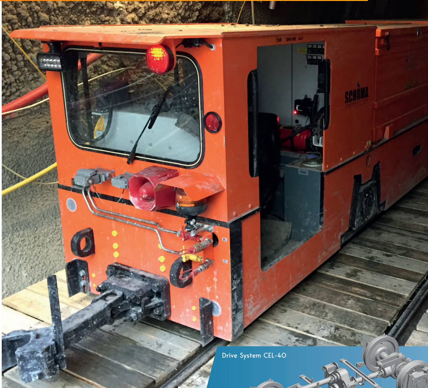
Drive System CEL-40

robust / emission-free / sensitive driving / wear-free braking & driving / maintenance-friendly / energy recovery while braking