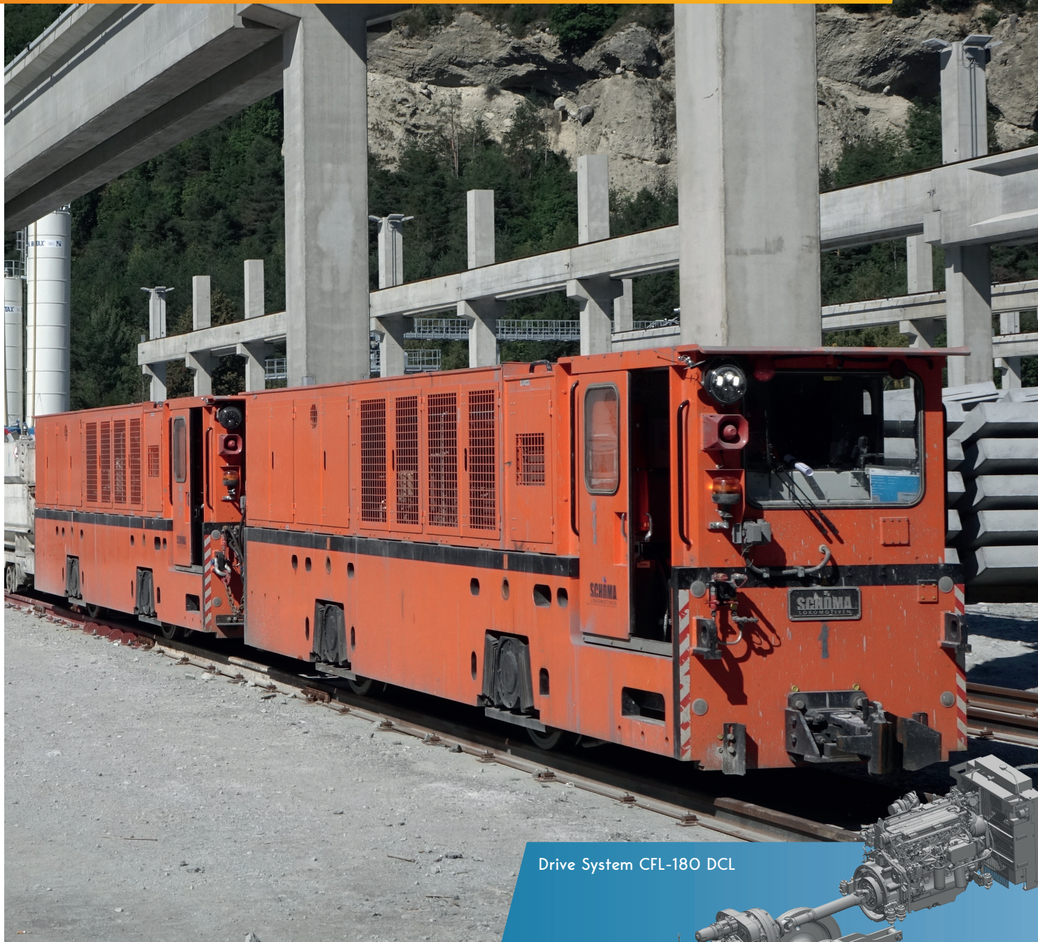
Drive System CFL-180 DCL

robust / long-lasting / maintenance-friendly / attractive prices